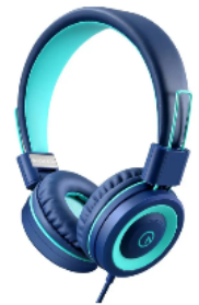
Noot K11 Kids Headphones